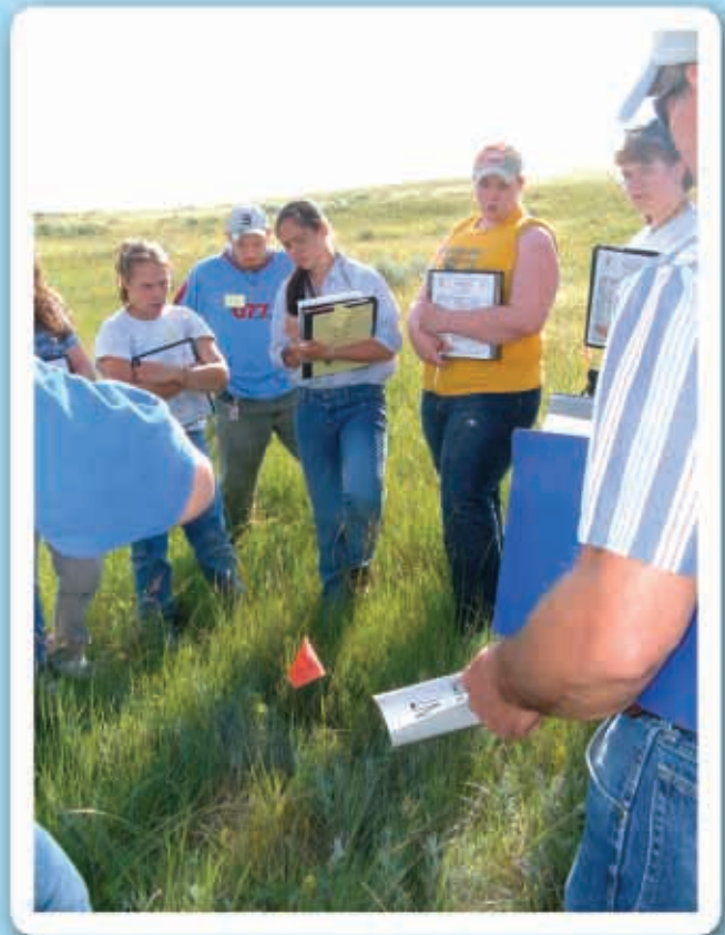
High school age Range Days students learn at the college level.

Selection is based on the applicant’s involvement in range activities, leadership, academic achievement and financial need. The deadline for application forms to be submitted is April 30. The winners will be announced publicly at a presentation on June 21 at the 2005 Montana Range Days in Clyde Park.